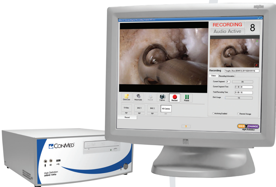
HD 1080P CAMERA SYSTEM